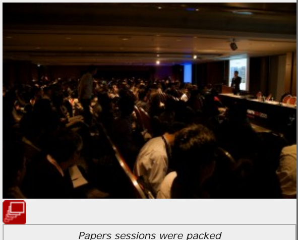
Papers sessions were packed

This was then put back into a photoshopped cleaned up version of the original frame and bingo - one snap shot of a single herd of elephants taken without any special lenses or considerations - produced a remarkably good animated herd of Elephants, all you needed to do was pick the speed you wanted them to charge off your image and exit frame. While the system is not perfect, it is remarkable and will no doubt open up more papers in this area.